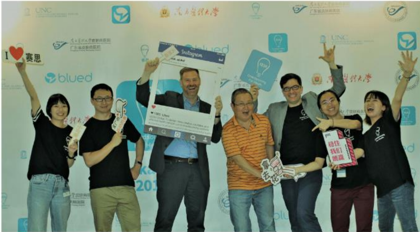
Hackathon to develop a mobile app for MSM